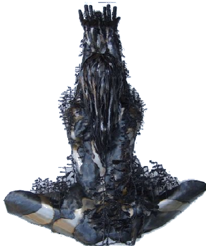
Born of the Rain